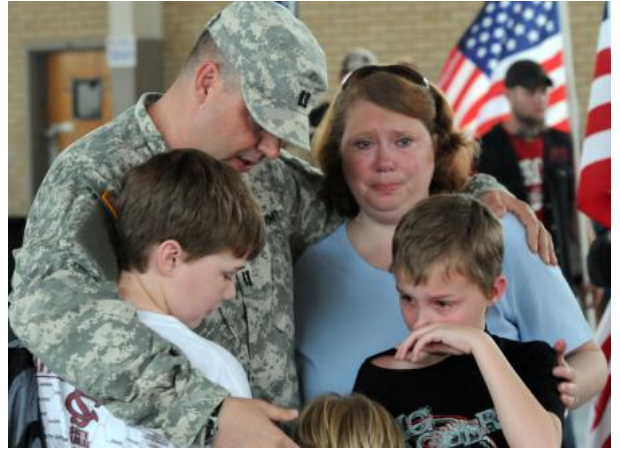
Above: A soldier of the South Carolina National Guard's Agribusiness Development Team says one final goodbye to his family before departing the Bluff Road Armory en route to Afghanistan via Camp Atterbury, Ind., Sunday, March 18. The unit will undergo predeployment training before heading to Afghanistan later this spring.