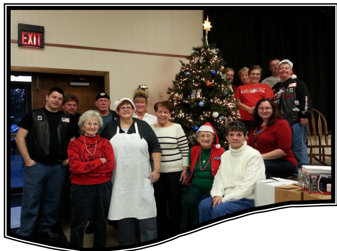
F.—Victory House Monthly Dinner. Auxiliary and Riders Volunteers

A Brief Photographical Look-Back... 2013 was another great year for Post #34! While we're always keeping busy holding events and participating in activities that benefit and/or honor our veterans (Photos A, B, C & F), we also know how to have fun with our fellow members, visitors to our Post and family (Photos D & E).